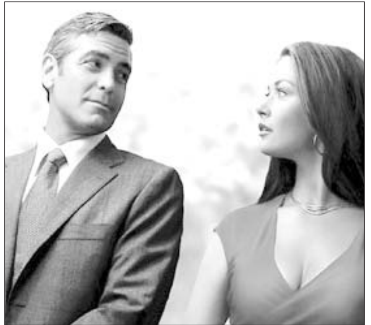
Although cold in the start, the acting of George Clooney and Catherine Zeta Jones warms up to form a highly enjoyable but shallow comedy.

This movie is much too large to properly review in such a small space.